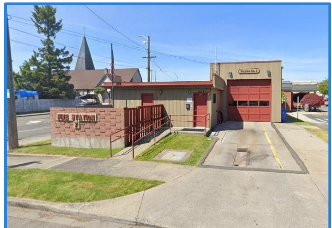
Current Fire Station #7 Facility

Finances: The $2 million in state funds will be matched with $2 million in city Real Estate Excise Tax Revenues and will be used to acquire, design and produce construction documents to make the project shovel ready. The City is forming a Facilities Advisory Committee of community members to develop a capital bond to complete the project funding.